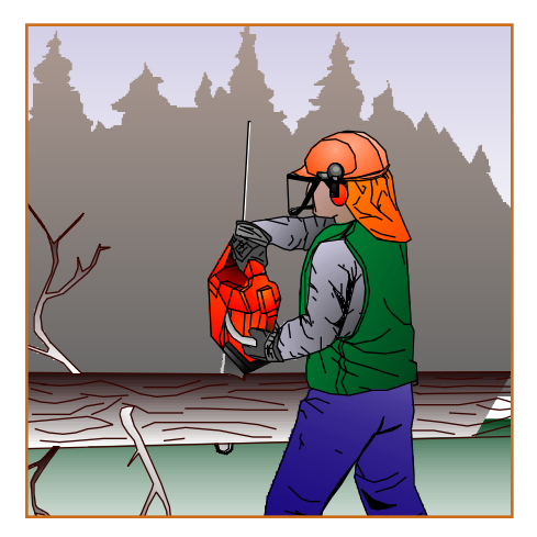
NEVER backcut pulling the blade toward yourself.