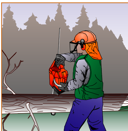
NEVER backcut pulling the blade toward yourself.